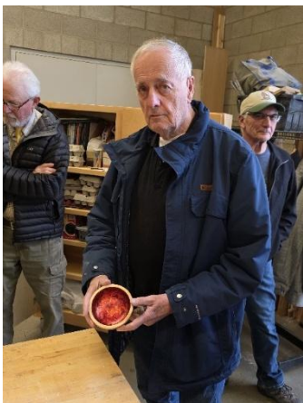
Norm a bowl with gold leaf finish.